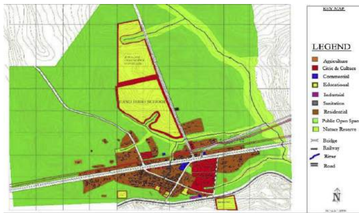
Figure 1: Structural Map of Ejisu Municipal Assembly