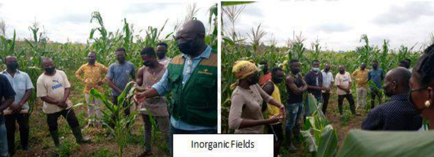
Field day to showcase the performance of organic fertilizer against inorganic fertilizer.